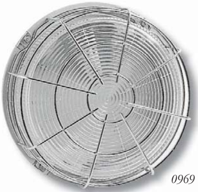
0969 01 + 0958 55