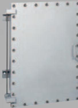
Painted cast iron or steel