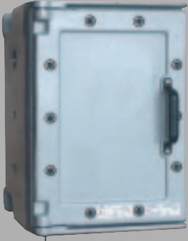
Marine grade aluminium alloy

Climatic conditions, mechanical stresses or chemical constraints relating to the type of industry require careful consideration on site.