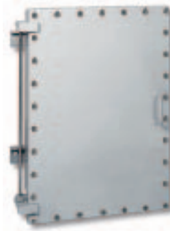
Flexible mechanically-welded steel enclosure