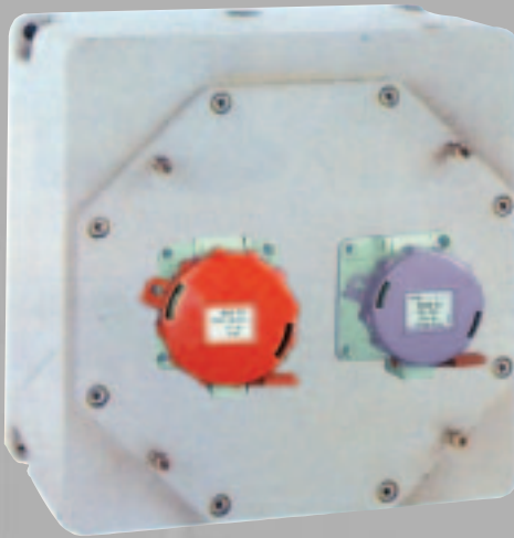
IIC aluminium enclosure equipped with one 3P + E socket 380/415 V and one ELV 2P + E socket 20/25 V

To meet all your installation requirements, ATX offers a complete range of Extra Low Voltage (ELV) and Low Voltage 16 and 32 A flush-mounting sockets in 24 V, 110 V, 220 V, 380 V, 500 V versions.