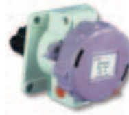
Flush-mounting socket 0944 25