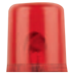
0950 84 Red globe