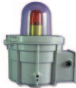
0951 21 Flashing beacon