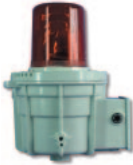
0951 17 + 095084 Static beacon + globe