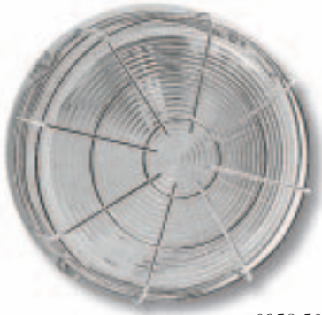
0958 50 + 0958 55